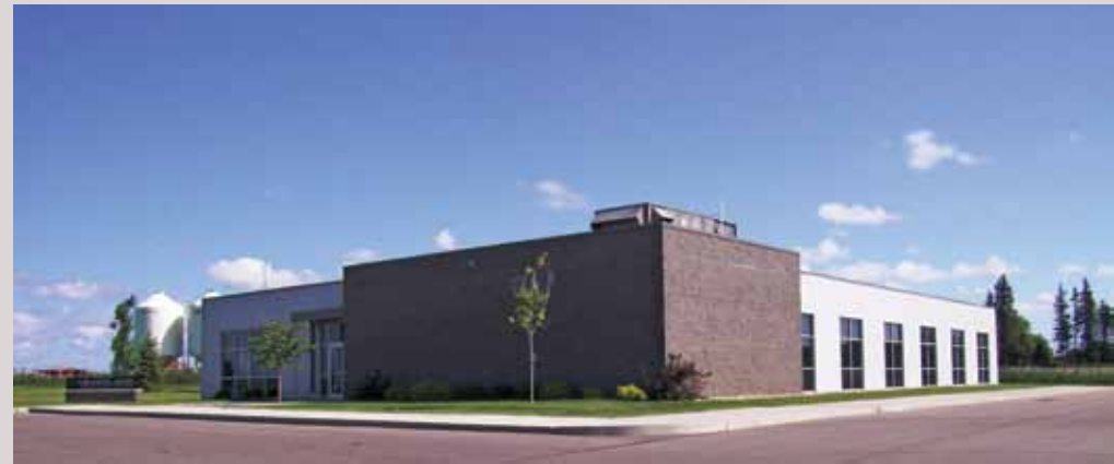
The Heartland Technology Center

Development corporations need access to these types of funds. South Dakota Rural Enterprise is a great organization that provides capital to disperse into the community, creating jobs and wealth.